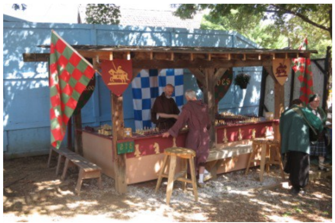
Our "Knight Moves" chess booth (Located not far from front entrance in the Games area and ideally located near the Royal Privies and not far from the Jousting area)

THANKS TO ALL WHO MADE OUR RENAISSANCE CHESS BOOTH SUCCESSFUL