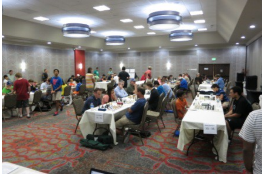
The Playing Hall (I heard no complaints about noise or lighting)- 99 players- Event to return here in 2017