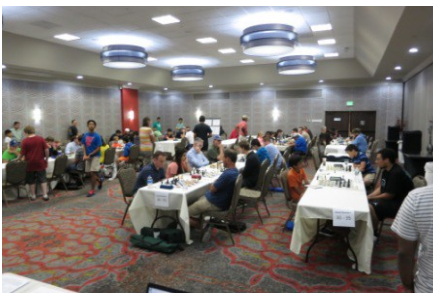
The Playing Hall (I heard no complaints about noise or lighting)- 99 players- Event to return here in 2017